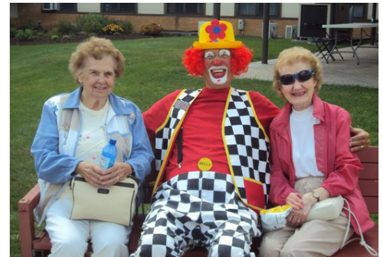
Right - Some resident family members take a break from their activity-filled day to pose for a photo with an ALSM clown.