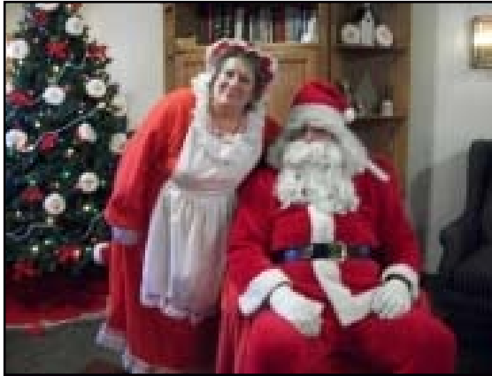
Mr. & Mrs. Santa Claus

along with Mrs. Claus to greet residents and guests. Thanks to all of the volunteers that helped out that day. Without them these events could not be a success. The atmosphere was festive and a great time was had by all.