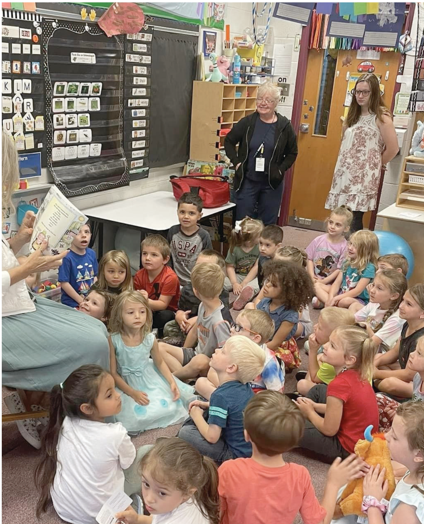
There's nothing better than gathering together for a good story! Our Head Start students love exploring new adventures through books – building imagination, language skills, and a lifelong love of reading.